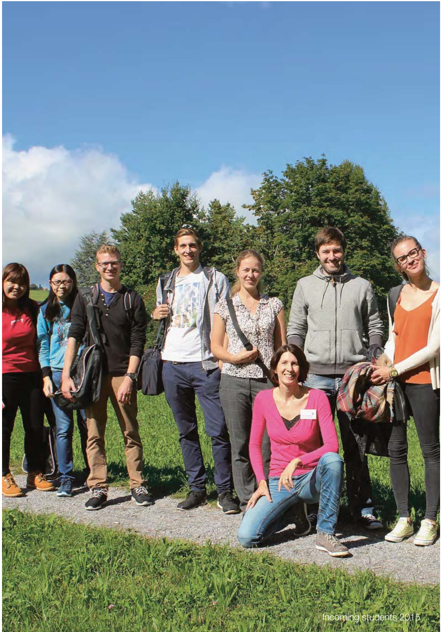
Incoming students 2015