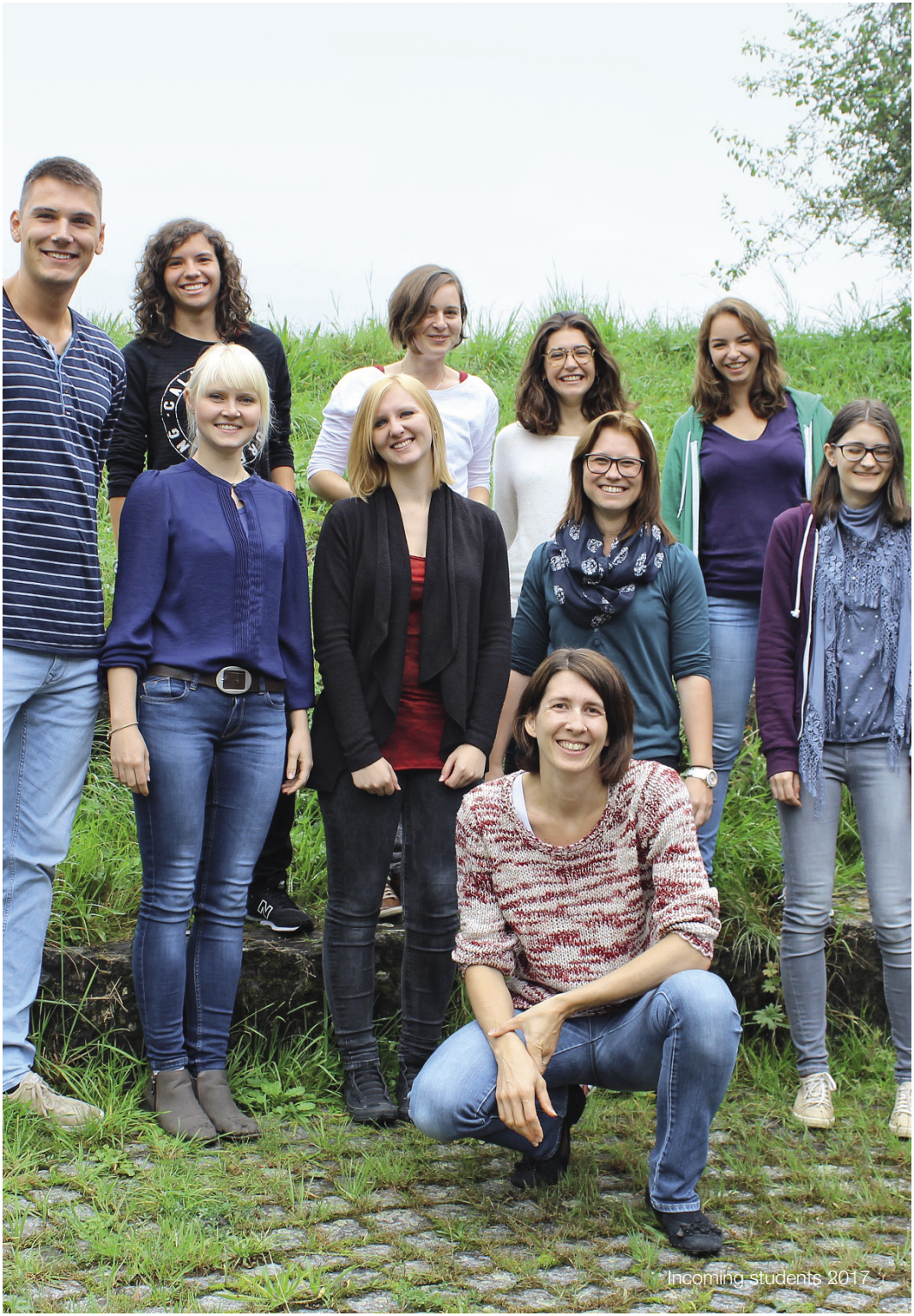
Incoming students 2017